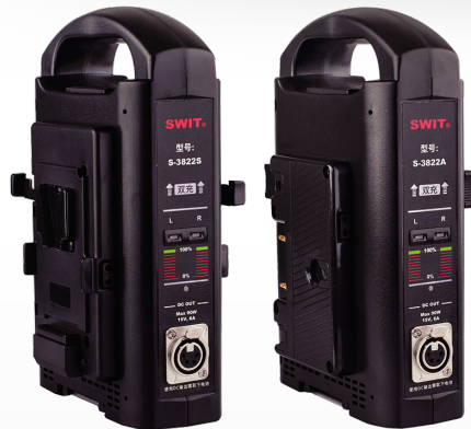
S-3822S for V-Mount