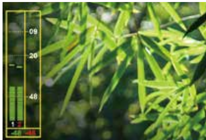
2-ch audio bar