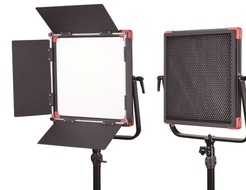
LA-HE60 4-leaf metal barn door