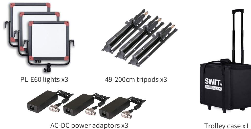
PL-E60 lights x3