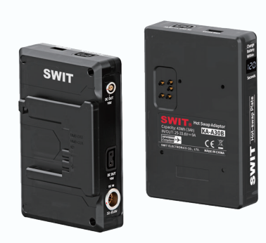
KA-A30B For ARRI ALEXA SXT / LF/ 65