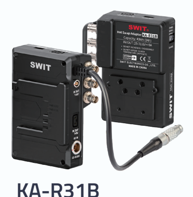
For ARRI ALEXA MINI / MINI LF with SDI 1-2 Distribution and Isolater