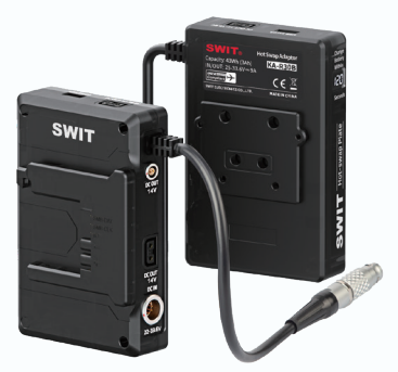
KA-R30B For ARRI ALEXA MINI / MINI LE