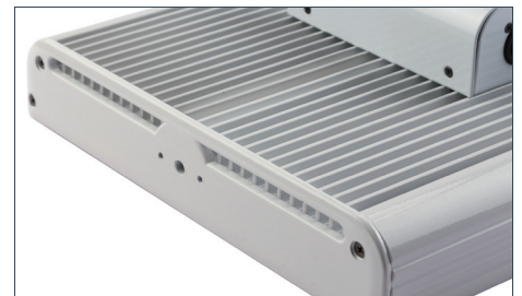
Fanless heat dissipation