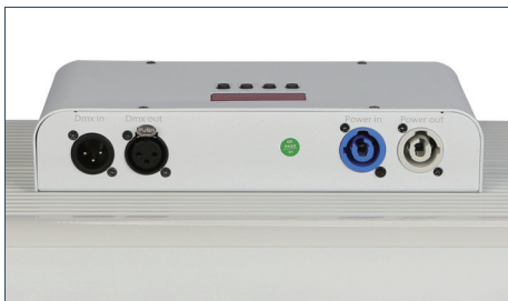
DMX in & out; AC in & loop